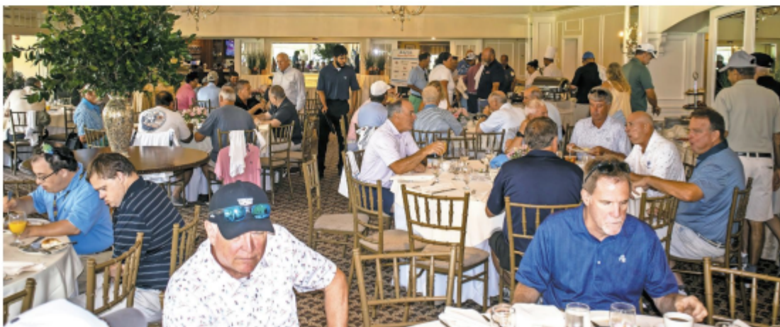
Guests gather and enjoy the brunch before a big day of golf.