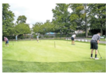
Golfers tee up on the green at the Hempstead Golf and Country Club.